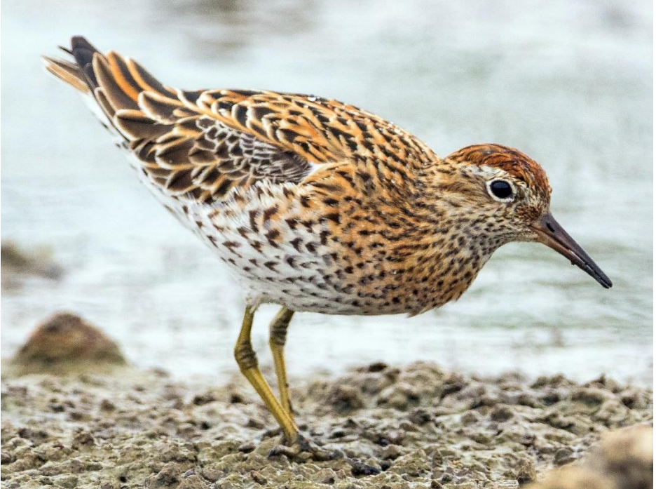
Sharp-tailed Sandpiper ( https://ebird.org/species/shtsan )

50 Signal Hill Road, Ōpoho, Dunedin 9010