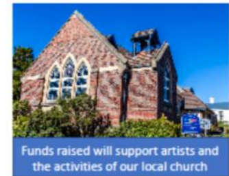
Funds raised will support artists and the activities of our local church

Opoho Presbyterian Church Hall Signal Hill Road and Farquharson Street