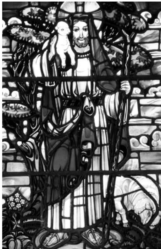
Christ the Good Shepherd, stained glass window, First Presbyterian Church, Invercargill

Everyone here is seeking to know God better, and we're glad you have joined us on this journey.