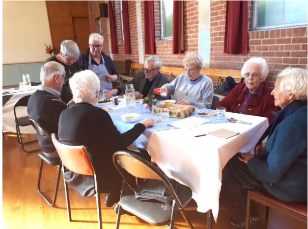
Soup Kitchen table service