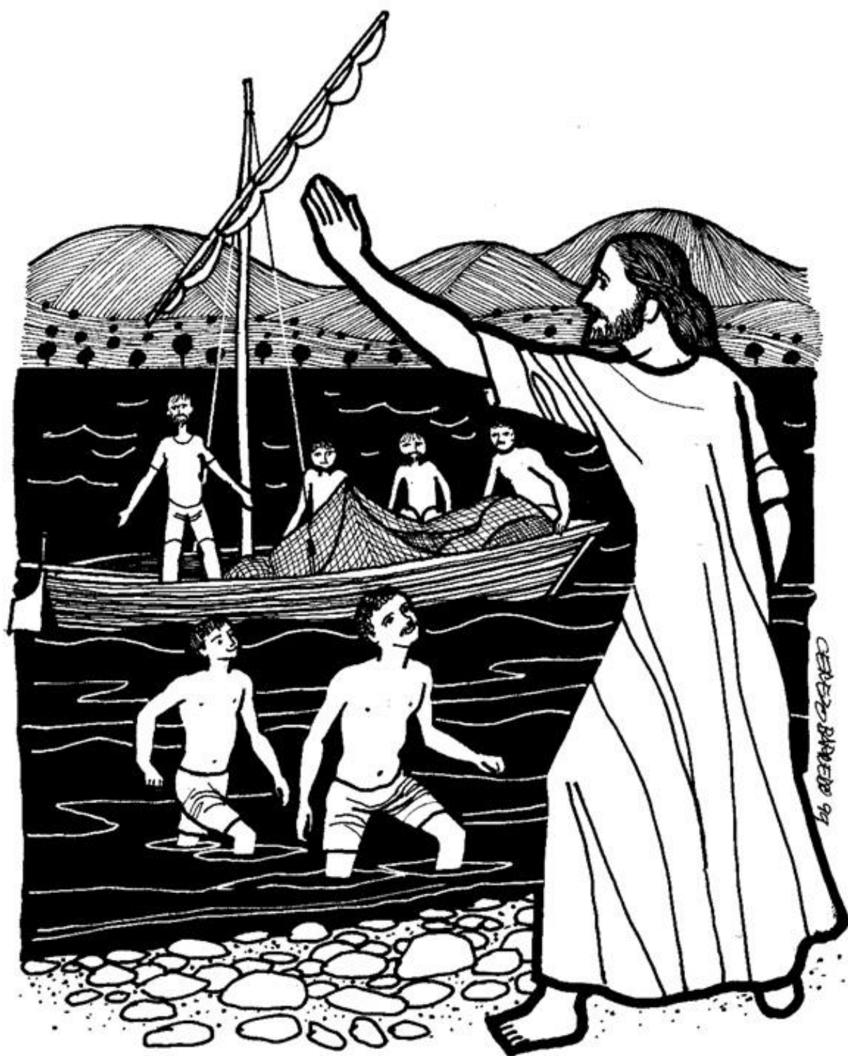
Mark 1: 14-20