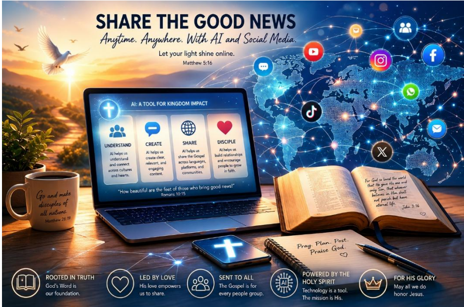
Image generated by Chat GPT using artificial intelligence with the following prompt: "an image to reflect to online sharing of the gospel using AI and social media".

The newsletter of Ōpoho Presbyterian Church 50 Signal Hill Road, Ōpoho, Dunedin 9010